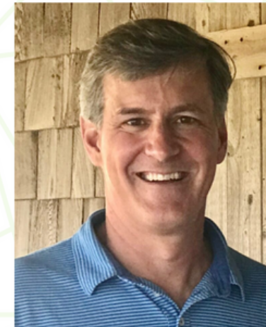
GORDON W. WALLACE JR. HALL